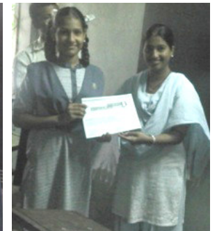
Principal (Eng Med)