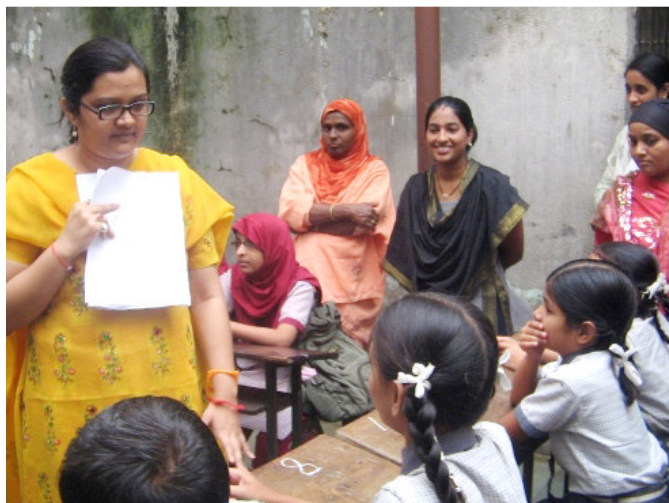
The quiz master

The above insight-gain for us was a byproduct of the "Science quiz and science video program" at Chatrapati Shivaji School (Dharavi), the main agenda of which was to make kids aware of the interesting facets of world of science and to build a spirit of curiosity and inquisitiveness among them. These events were conducted by PeFSSSED (in conjunction with UDAAN, the CSR wing of Geometric Global) under Child Talent Enhancement Program of PeFSSSED on the theme of 'Science'.