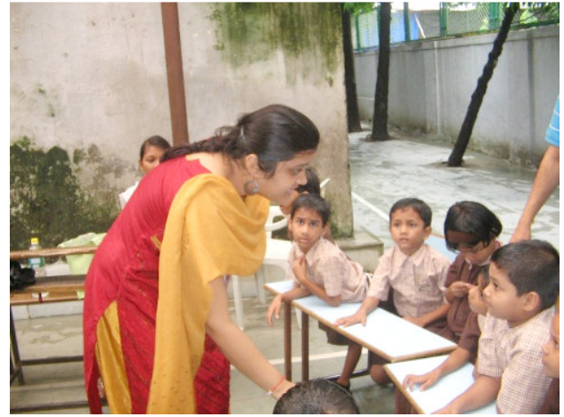
Ensuring thorough understanding