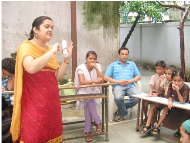
Making the kids to think beyond the obvious