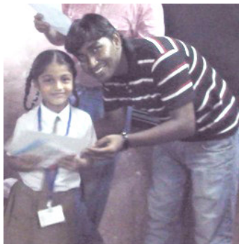
Received from Pravin