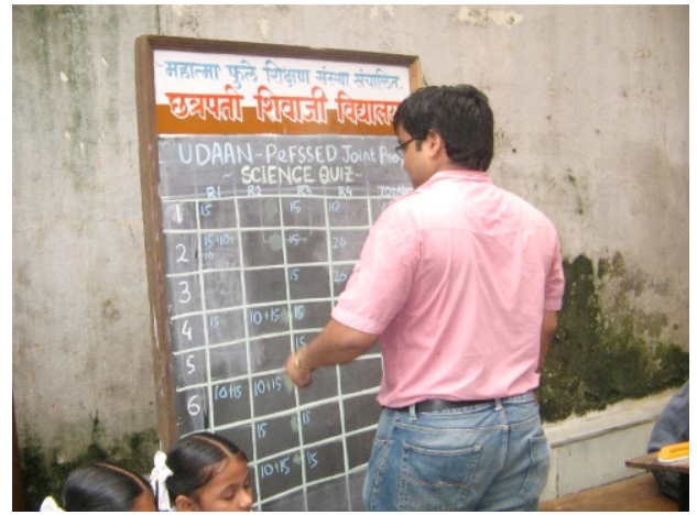
Scoring in progress