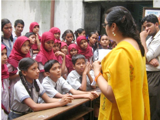
The seriousness during the sessions

provide detailed explanation of the question and answer. It was encouraging to find a few students went depth into the subjects and posed counter questions. It was a good experience for the teachers, who also helped with translations. After the event the team spent some time with the kids explaining their doubts.