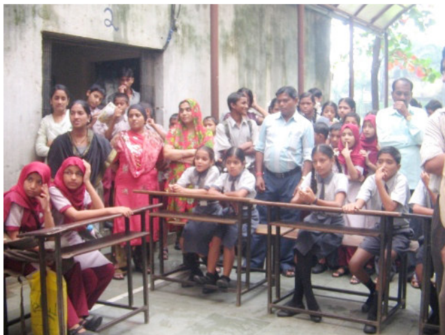
Teachers also gathered on the occasion