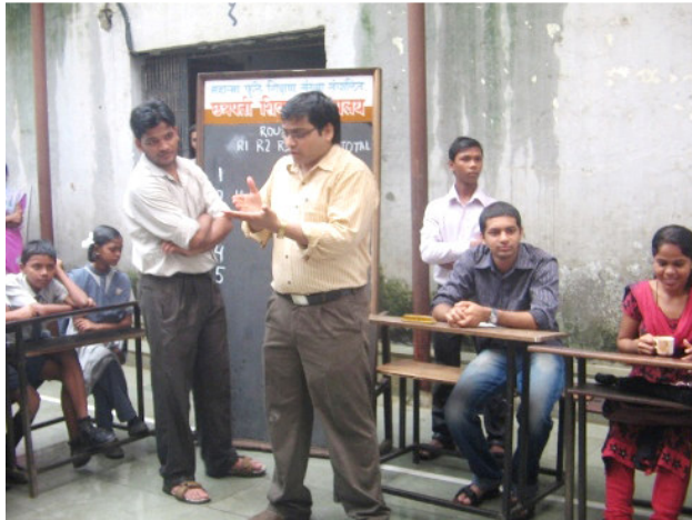
Explanation given for each answer