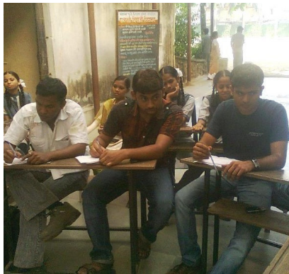
Scoring in progress