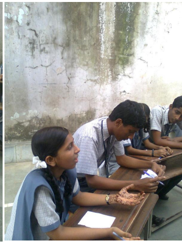
A student initiating. Chits were given to note points.