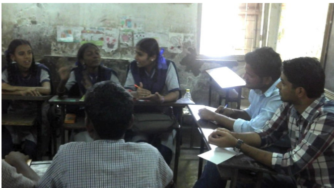
A girl in Marathi medium making a point