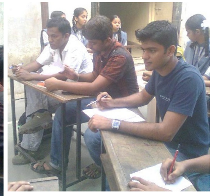
Judges had to sit through hours