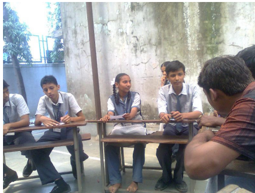
A participant making his point