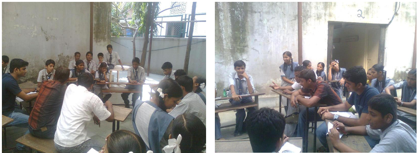
The audience who are the classmates paid attention to the proceedings.

After the initial round of group discussion, two to three students from each medium were chosen as finalist and a final round was conducted for every medium. The final round for every medium was well performed by the students. Unlike quiz session, in this event all the student of the class participated. Having many preliminary rounds before the final round made this possible.