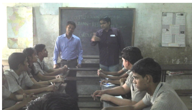
Lecture on importance of English Language