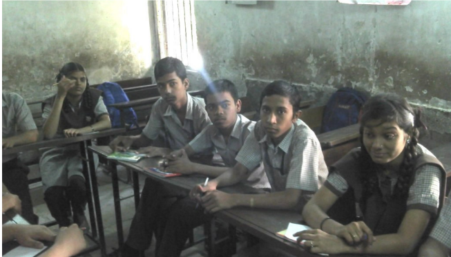
Hindi Medium students final round GD Session about to begin.

Since the students were encountering this event for the first time, usually the first group of students from every medium was having no idea as to how to present themselves in the discussion. The judges had to intervene frequently to make the participant speak. Students were encouraged to speak in English during the discussion. After the first batch was done with the discussion the later groups did well as they got an idea of how a group discussion takes place.