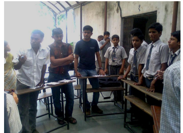
One last point

The best speakers were awarded on the occasion of Republic day (26 th January, 2012). We are yet to obtain the pictures for the same. For purchase of these awards Deepti had supported financially. Also, Ganesh supported the logistics. In our next report, we will include the photograph of the award ceremony.