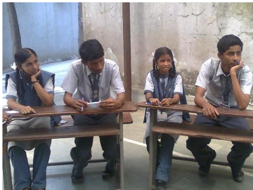
Attention to details