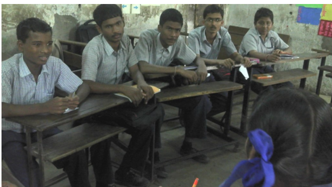
Participants giving an attentive ear