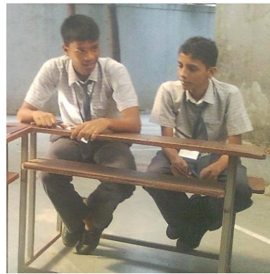
Got the courage to speak