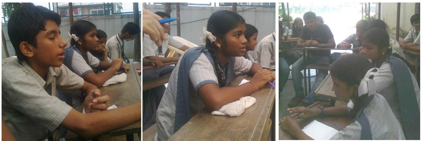
After some encouragement and experience, participants came forward to speak out their minds confidently