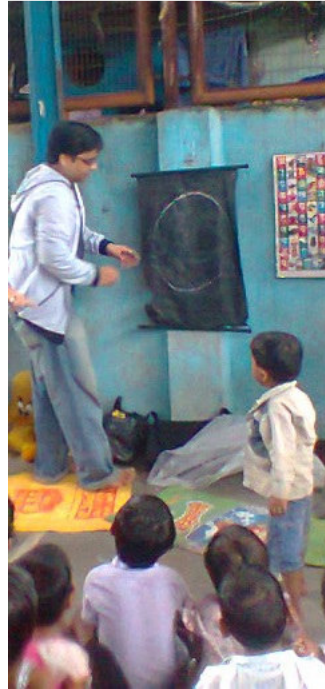
Explaining the shape of Earth