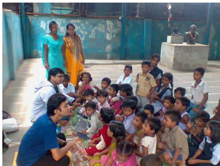
Knowing each other

The content of program, which was focused on scientific learning by use of small live experiments, remained same for both the PEN Balwadi centers. The program was divided into four sections – Living and nonliving, States of matter, Space and earth, and Shape recognition. The activities in the program were based on daily life happenings so as to develop curiosity of children towards their immediate surroundings through a sense of observation and reasoning.