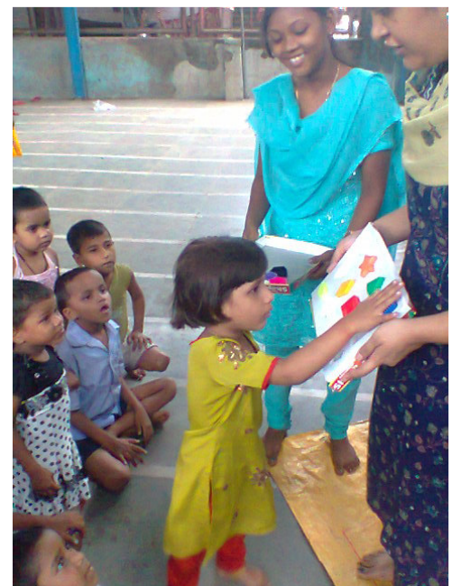
The Game underway