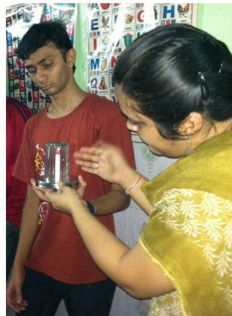
The candle experiment – where it blows out due to absence of air