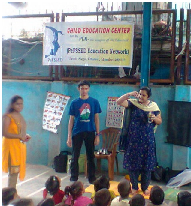
How solid doesn't change shape

First the kids were shown a rock and explained the properties of a solid body. Then the same exercise was done again with the water for explaining liquid body's properties. Different shapes of glass containers were used to demonstrate the fact that liquid does not have its own shape, but takes the shape of the container, which carries it. When kids were able to distinguish between liquid and solid a third matter, gas was added in the study. It was explained that there is air around us—that we can't see, but feel—which helps us breathe and smell. This was illustrated with the fragrance of a scented stick filling the room space. Another experiment was conducted to demonstrate how air helps in burning. A candle