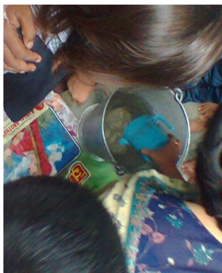
Straight push exerts pressure, tilted push generates bubble

the trapped air inside the pot prevents water to go inside. Then the kids were asked to tilt the pot and observe water going inside the pot and air coming out as bubbles. This experiment was repeated with different group of kids and let them perform also. It helped them to experience the