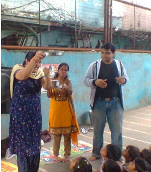
The experiment on rain

principle. They were given brief ideas about the seasons. Kids showed lot of enthusiasm about this rain experiment and asked lots of questions.