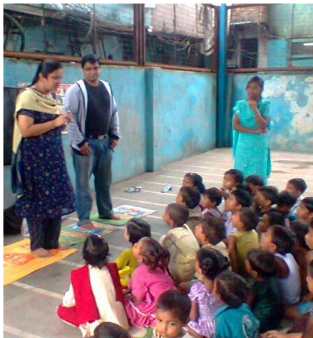
How liquid changes shape