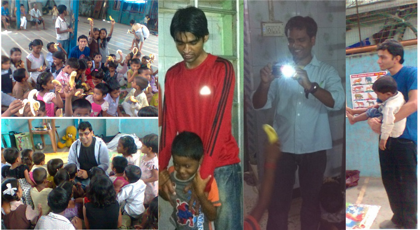
Spending time with kids

After whole session we gave kids bananas and spent some quality time with them in playing together and explaining their doubts, listening to their poems and stories and making fun of each other.